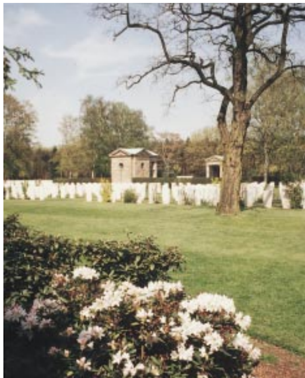
Rheinberg War Cemetery

Designed by Philip Hepworth and first opened in 1946, the cemetery is pleasantly sited in agricultural land protected on the north, east and west by neighbouring woods. It is formal in design; wrought-iron gates in a wide entrance open to a central turfed avenue where the Stone of Remembrance and Cross of Sacrifice stand. These monuments are described in the notes on Reichswald Forest War Cemetery. A shelter on each side of the Stone and a colonnade beyond the Cross are built of Oberkirchner stone. A second avenue stretches across the cemetery from the south-west to the north-east boundaries, where semi-circular stone seats are placed.