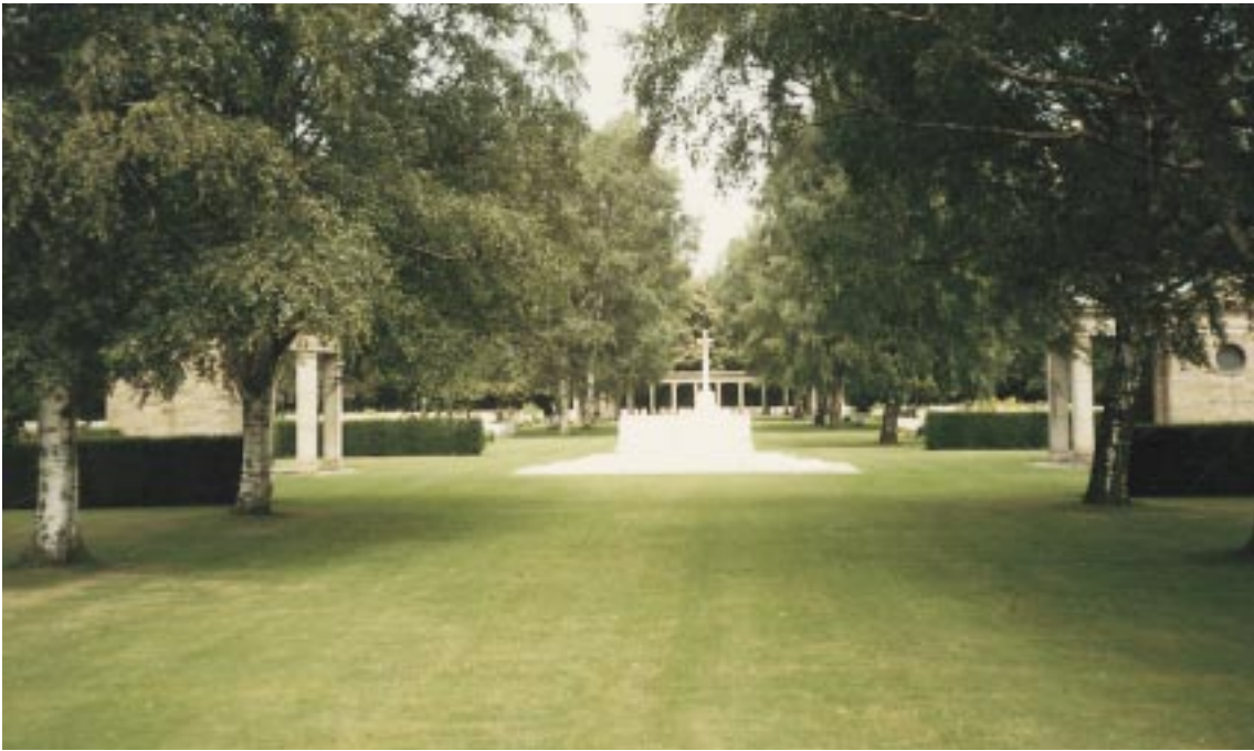
View of Rheinberg War Cemetery from the entrance

Fourteen seamen of the Merchant Navy are buried here and there are two graves of sailors of the Royal Navy.