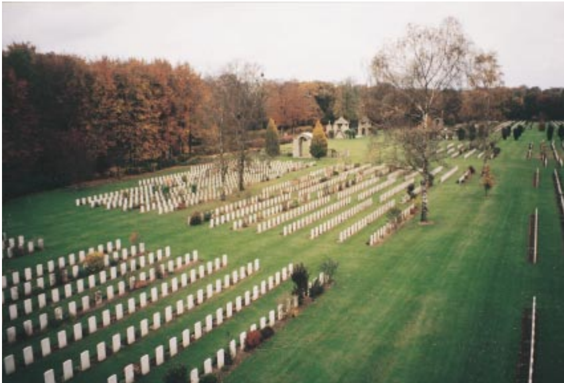
Reichswald Forest War Cemetery