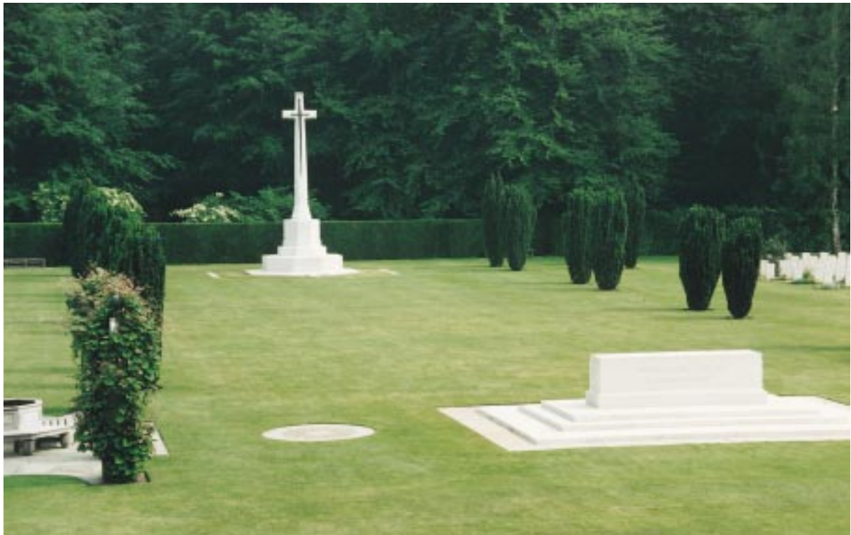
The Stone of Remembrance and Cross of Sacrifice in Reichswald Forest War Cemetery

Two shelter buildings near the entrance are built in warm Oberkirchner stone, as are the two smaller shelters at the opposite boundary, and on the piers at each entrance are set a lion and unicorn carved in Portland stone by Gilbert Ledward. Flights of granite steps lead to the upper floors, from which there are extensive views over the cemetery. The shelters stand on the edge of a wide sweep of turf and on the north-east and south-west there are stone archways with low wing walls. The altar-like Stone of Remembrance designed by Sir Edwin Lutyens stands near the centre of the cemetery. Upon it are carved the words from the Book of Ecclesiasticus: THEIR NAME LIVETH FOR EVERMORE. Beyond, a wide avenue leads to the Cross of Sacrifice, which stands at the south-east boundary against the forest background. Like the Stone of Remembrance, the Cross is common to most Commonwealth war cemeteries. It was designed by Sir Reginald Blomfield and is set upon an octagonal base and bears a bronze sword upon its shaft.